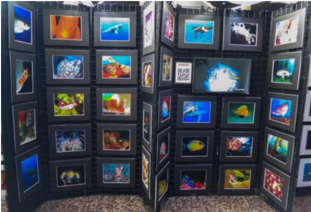
OCUPS Booth at 2016 SCUBA Show