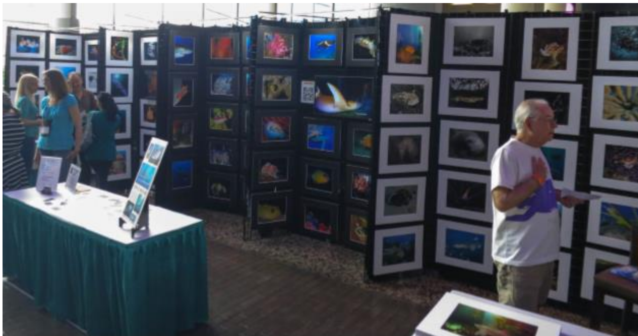
LAUPS, OCUPS and SDUPS Booths at 2016 SCUBA Show