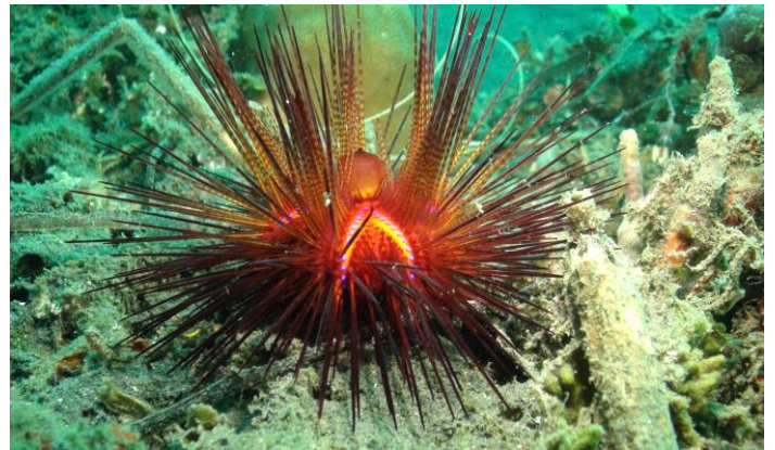
Fire Urchin, Indonesia

Fire Coral Hydroids Crown of thorns sea star Urchins Red bristle worms