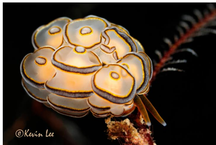
Photo of Doto greenamyeri