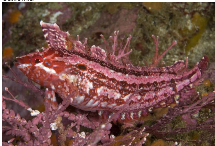
Crevice Kelp Fish ( Gibbonsia montereyensis )

Usually found lounging in algae, feeds mostly on polychaete worms. Range: British Columbia, Canada to Baja California, Mexico.