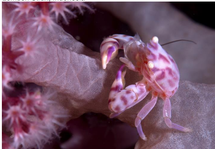
Soft Coral Procelain Crab ( Lissoporcellana nakasonei )