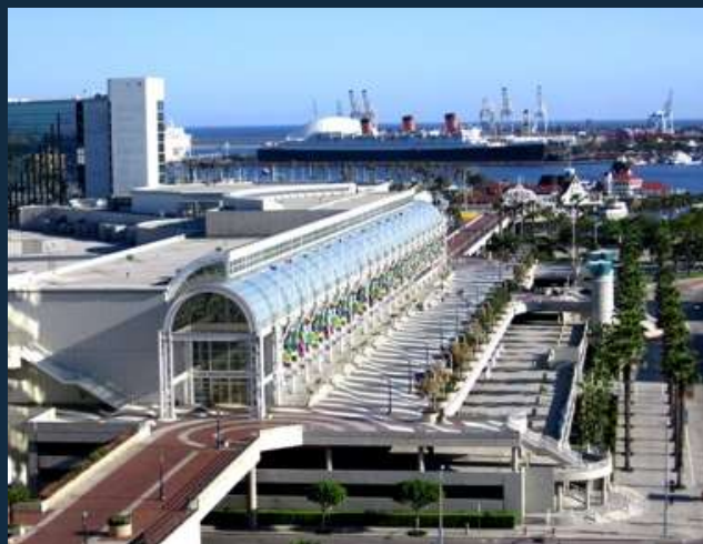
Beautiful Long Beach Convention Center